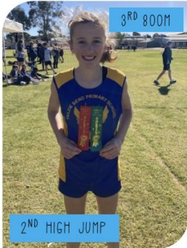
3 RD 800M