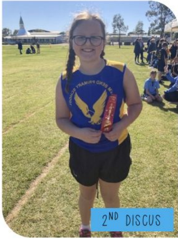
2 ND DISCUS