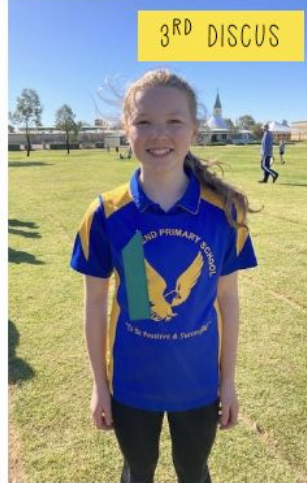
3 RD DISCUS