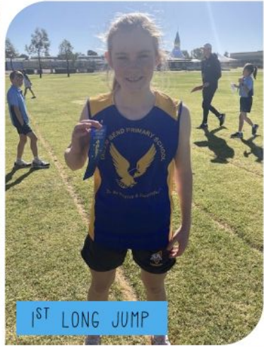
1 ST LONG JUMP