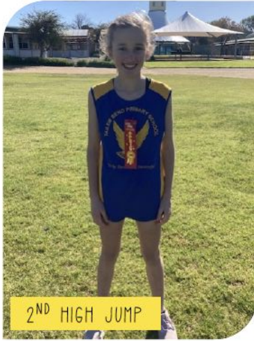
2 ND HIGH JUMP