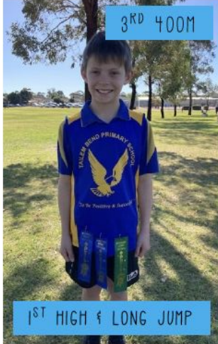
3 RD 400M