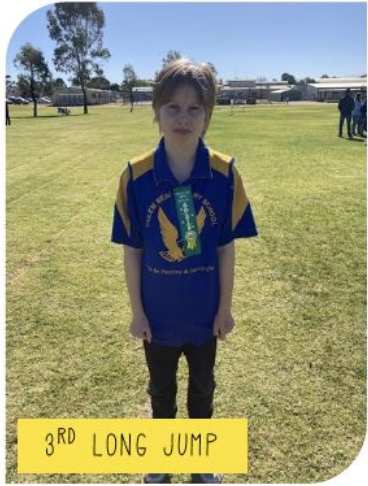
3 RD LONG JUMP