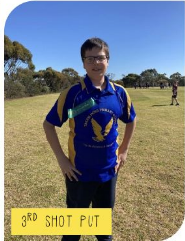
3 RD SHOT PUT